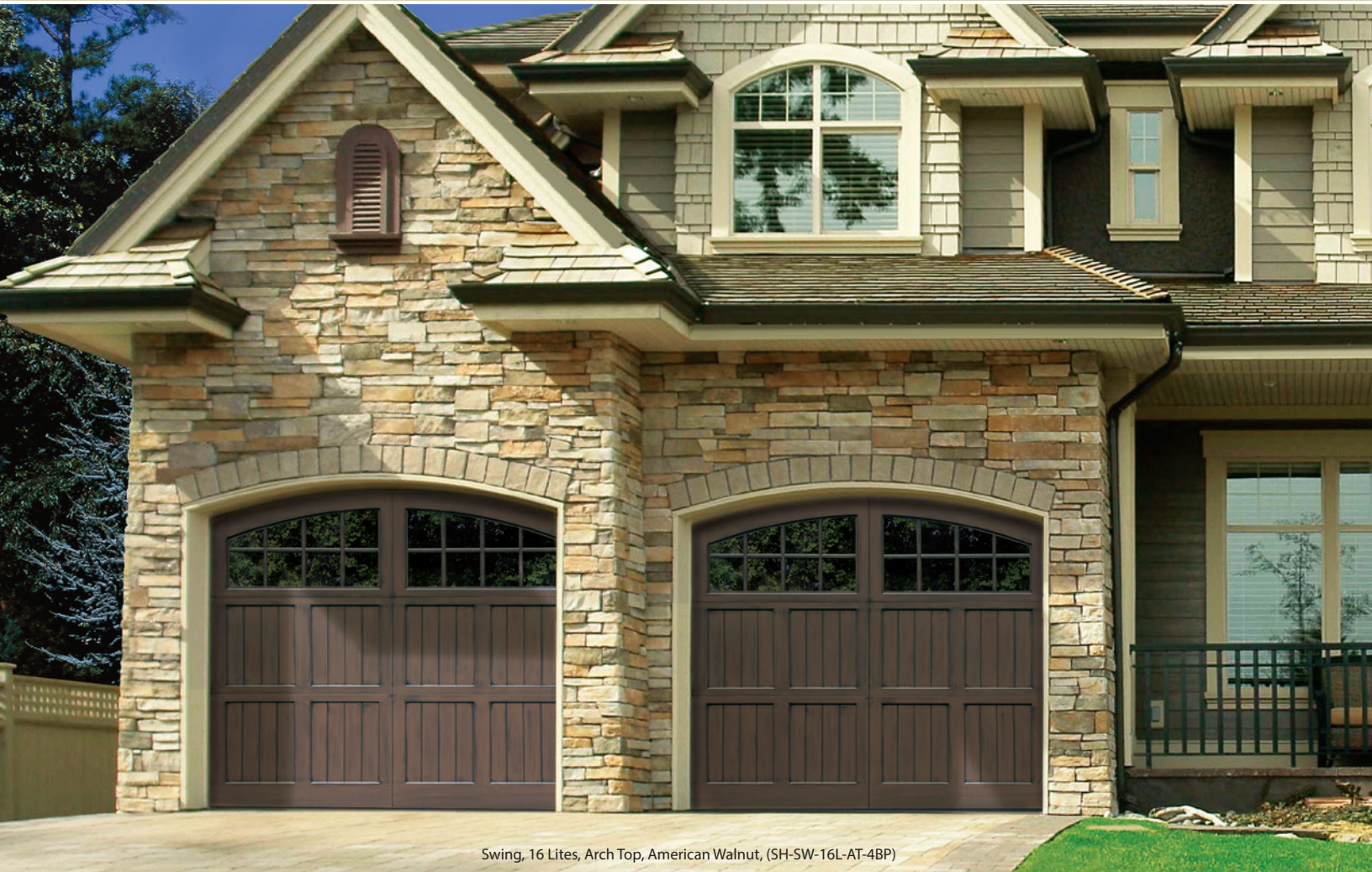
Swing, 16 Lites, Arch Top, American Walnut, (SH-SW-16L-AT-4BP)