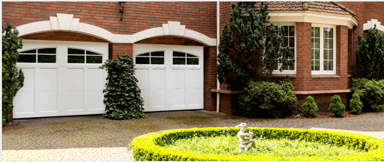
Elegant details bear 'up close' inspection.

Duet is available in standard and custom sizes in swing and trifold styles. Here's a small sampling of popular doors. Contact Artisan for additional possibilities and design help.